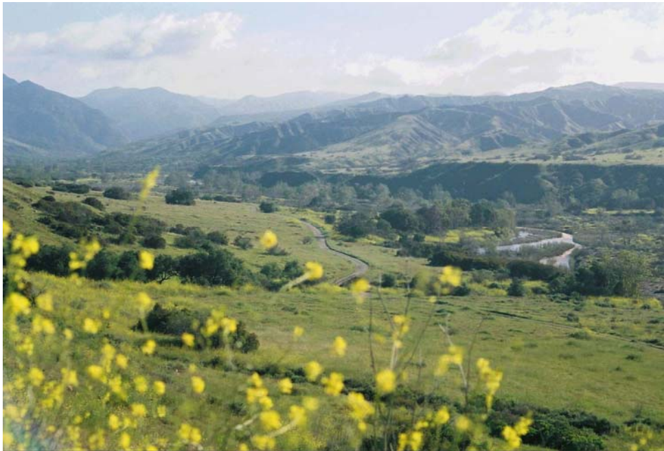
View of San Mateo Creek watershed – worth saving, don't you think?