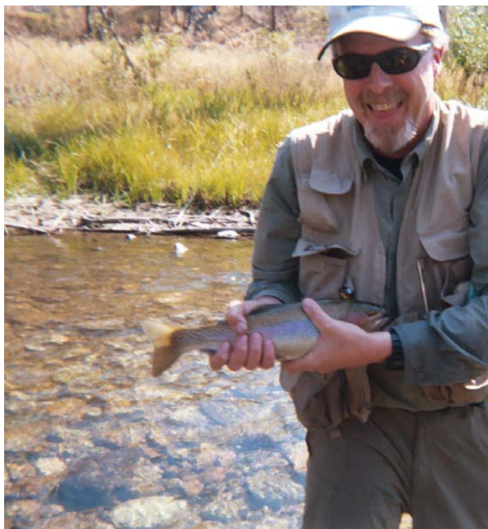
A fat female "cutbow", same place